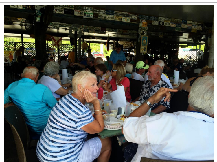
Great crowd food and fun

Thanks Sandy Zinn and Karen Sutton for Pictures