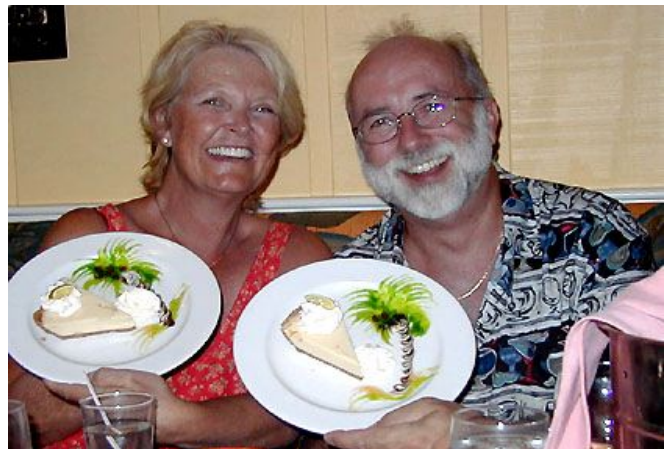
Decorated dessert plates