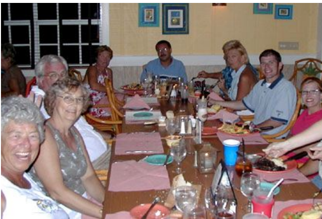
Ready for Dinner