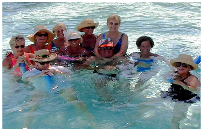
Enjoying the pool

Additional Photos are posted at the PhotoIsland web site. Go to: www.photoisland.com , use guest ID: sunbil and password: hyc select album: Labor Day