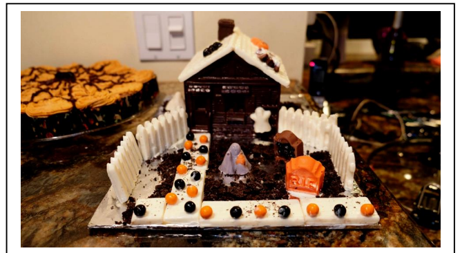
A few of the famous desserts at the Dean's Halloween Party