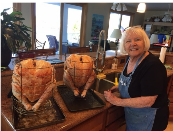
Preparation of the Birds