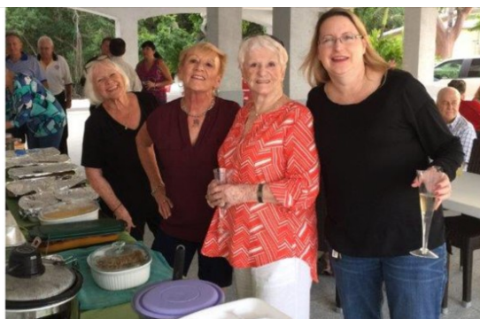
Checking out the Food Line