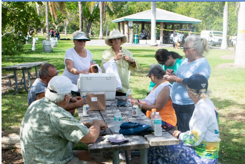
Relaxing after the cleanup at Homestead Bayfront Park