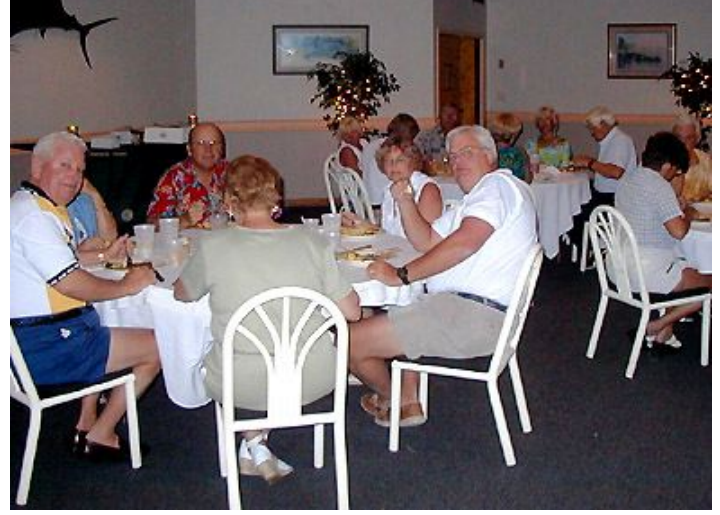
Dinner at Coconuts