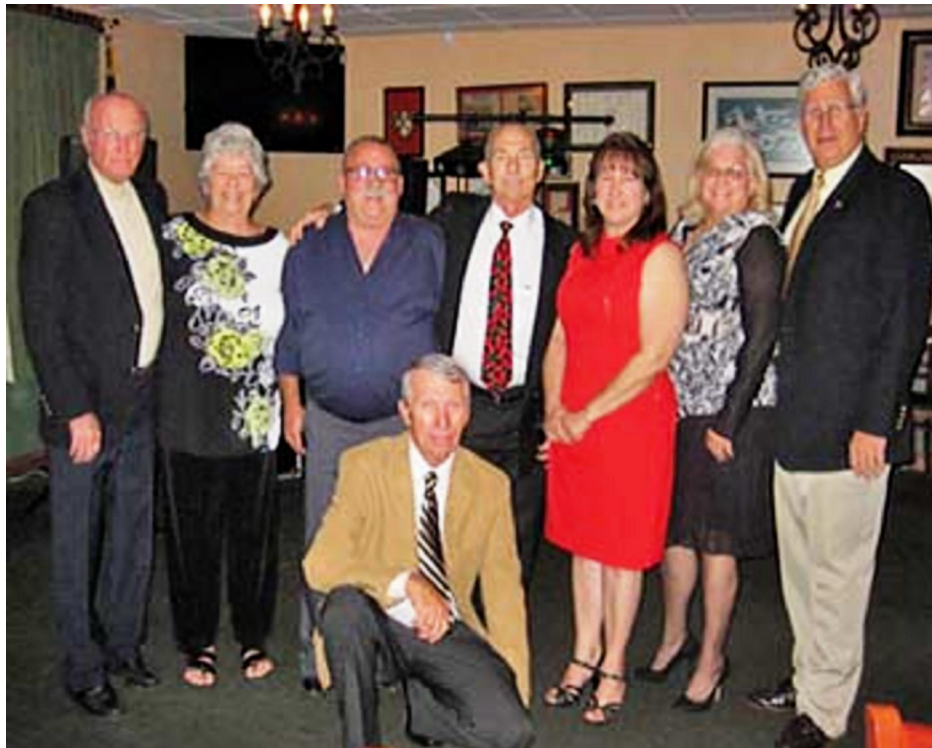
Your 2015 Bridge and Committee Members