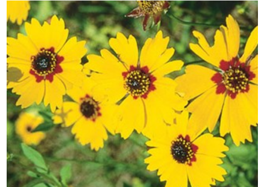
State Wildflower Coreopsis