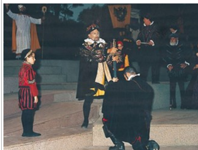
State Play Cross and Sword