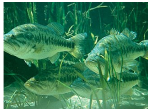
State Freshwater Fish Largemouth Bass