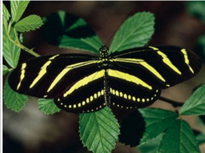
State Butterfly Zebra Longwing