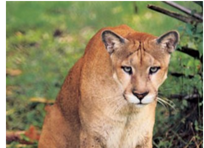
State Animal Florida Panther