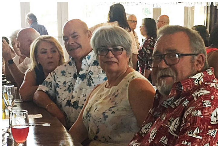
HYC at Winery