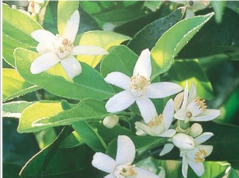
State Flower Orange Blossom