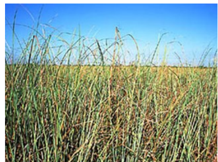
State Anthem Florida , Where the Sawgrass Meets the Sky