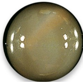
State Gem Moonstone