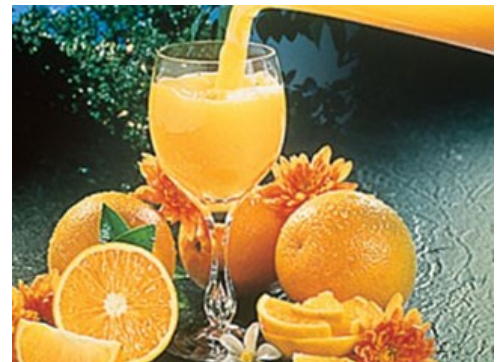
State Beverage Orange Juice