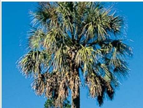
State Tree Sabal Palm