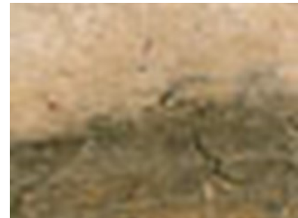
State Soil Myakka Fine Sand