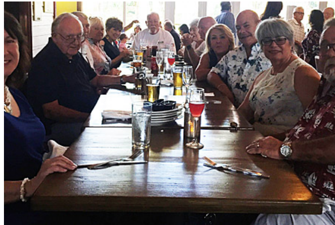
HYC at Winery