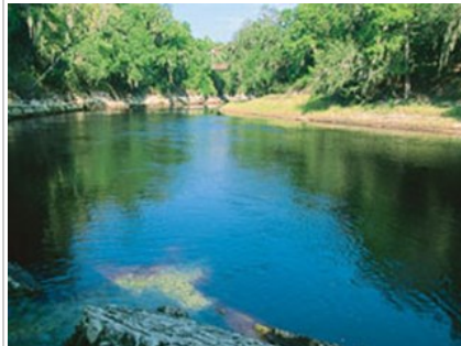
State Song "Old Folks at Home"