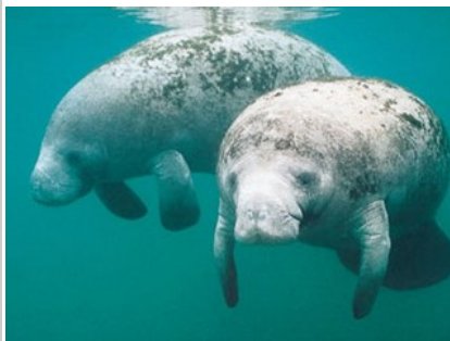
State Marine Mammal Manatee