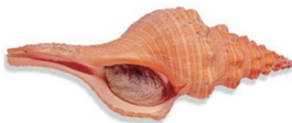
State Shell Horse Conch