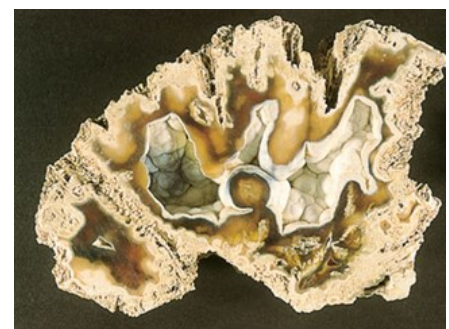
State Stone Agatized Coral