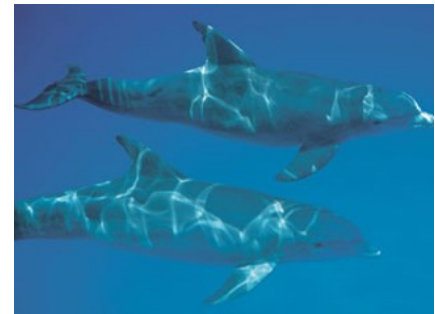
State Saltwater Mammal Porpoise or Dolphin