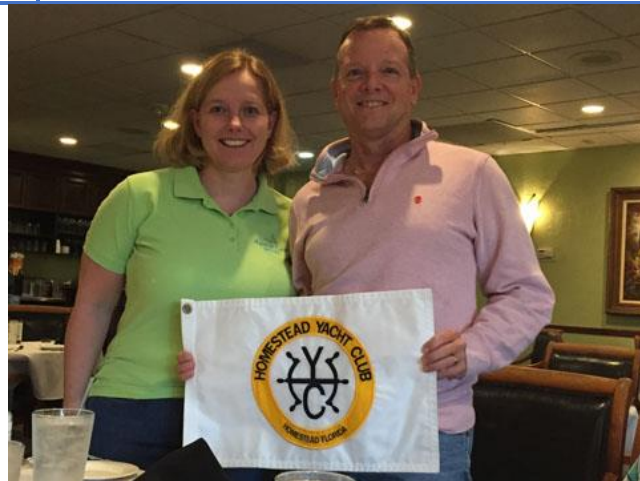
New Member with burgee