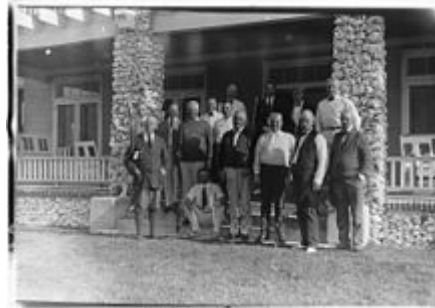
President Warren G. Harding and fishing party at the Cocolobo Cay Club

The two-story Lodge featured a wide front porch looking onto a lawn. Following its acquisition by the National Park Service, the club burned down on December 21, 1974. The two-room "casino", a separate building for games and cards, was repaired by the Park Service and used as a meeting place for students visiting the key. The caretaker's residence was rehabilitated for the use of the key's resident ranger. All of the Cocolobo structures were destroyed by Hurricane Andrew in 1992. Adams Key is now a day-use area, with two Park Service families residing on the island where the club used to be.