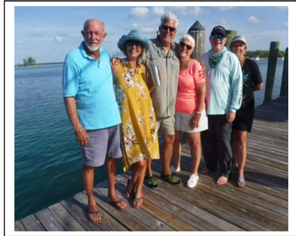
Members having fun in Bimini