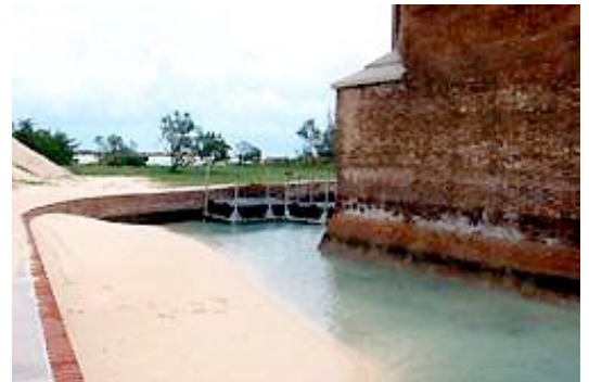
Sand over moat wall

According to the Park Service and Key's news sources, Ft Jefferson in the Dry Tortugas National Park was severely damaged by Hurricane Charley. Water came over the moat wall, washing some of the bricks away and filled part of the moat with sand. About 80% of the trees on the island were blown down and the finger docks next to the main dock were destroyed. The park is presently closed. Clean up and repairs are underway and it is hoped that at least part of the Park will be able to reopen sometime in September.