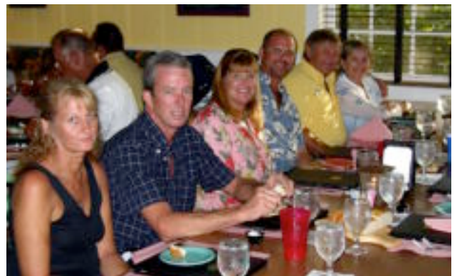
Saturday Night Dinner