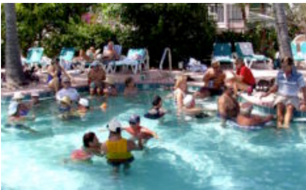
Enjoying the Pool