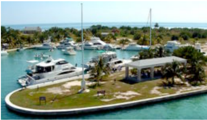
Boca Chita Harbor