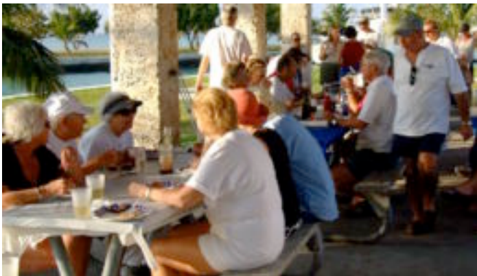
Saturday Evening Dinner