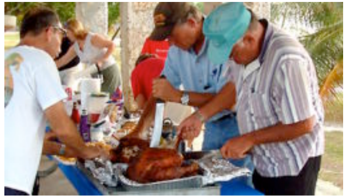
Carving the turkeys