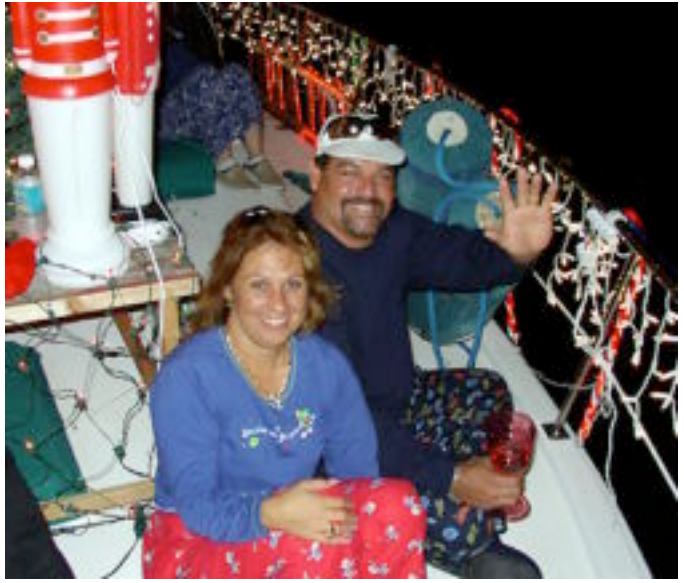
Part of the Xmas Crew