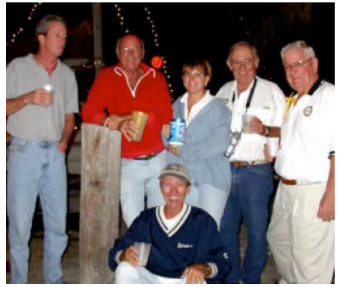
Would you trust your boat to this crew?