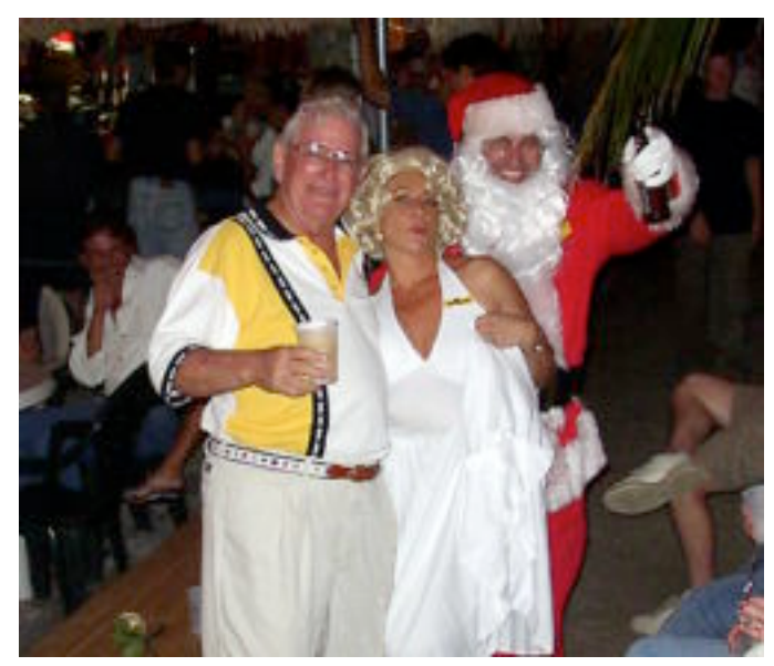
Even Marilyn was there.

Additional Photos have been posted to the Photo Island web site. Go to: www.photoisland.com and use guest ID: sunbil with password: hyc